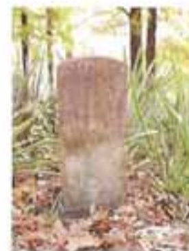
Orr Mill Cemetery

In 1951, the City started New Silver Brook Cemetery on Shockley Ferry Road with 10,500 continuous care grave sites and approximately 2600 remain available for purchase. A beautiful brick bell tower rises at the center of the property and a special place called "Babyland" is reserved for infants.