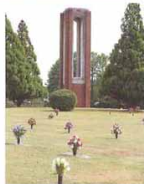
New Silver Brook Cemetery

Began in the early 1900's as a municipal cemetery for African Americans, Westview is located on Sayre Street. There are approximately 4100 gravesites on 25 acres with plans for expansion. African Americans who figure prominently in Anderson's history are laid to rest there including W. I. Peck and Fred Jackson, who were mortuary business pioneers.