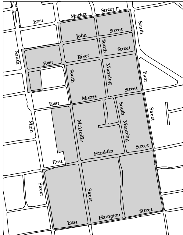
ANDERSON HISTORIC DISTRICT

Although living in an historic district is beneficial, there are certain responsibilities for the property owner. In order to maintain the historic significance of the neighborhoods, the Anderson Board of Architectural Review, established in 1986, has the responsibility for review and authorization of exterior changes to any property within the historic districts. Historic District Design Guidelines have recently been updated with comprehensive standards for property owners in Anderson.