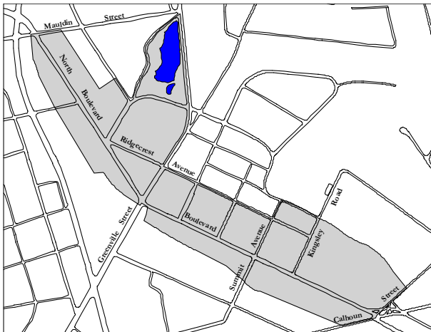
BOULEVARD HISTORIC DISTRICT

These historic district designations ensure and promote good design standards while preserving the architectural integrity and character of structures in the neighborhoods. By protecting the neighborhoods with the historic district designations, the residents benefit in a number of ways. Studies indicate that historic designations protect and actually increase property values, due in part to the increased involvement in restoration of structures within the boundaries of the districts and other preservation methods. Most importantly, an historic district provides a focal point for community pride. With these historic designations within the City of Anderson, all residents, whether living in the special districts or not, can look to these areas for a part of local history.